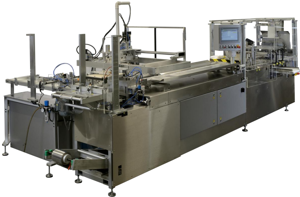
Picture shows customer machine with special features

With the WM 130/230 series, we offer a cost-effective and efficient version for the production of classic blister and thermoform packages with PVC or PET forming film and heatsealable lidding film (e.g. Alu, PET or paper foils)